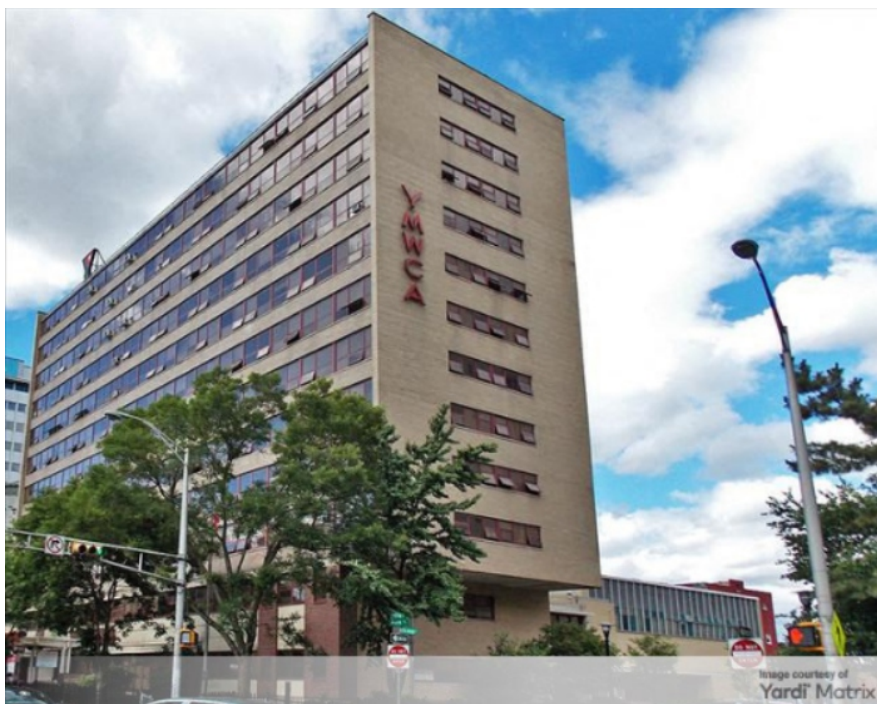
Newark YMCA, Newark, NJ, built 1881

Something must have been in the cement water back in 1880 because 12 of the oldest buildings we still rent today were completed in that year alone, back when household electrification wasn't even around. But, although electricity might not have been an amenity yet, with innovation and industrialization in full swing, building development witnessed huge progress. For example, the quality of the steel produced during this time became more dependable in construction. This makes some of these 141-year-old structures — such as the Newark, NJ YMCA — the first examples of successful steel-frame architecture.