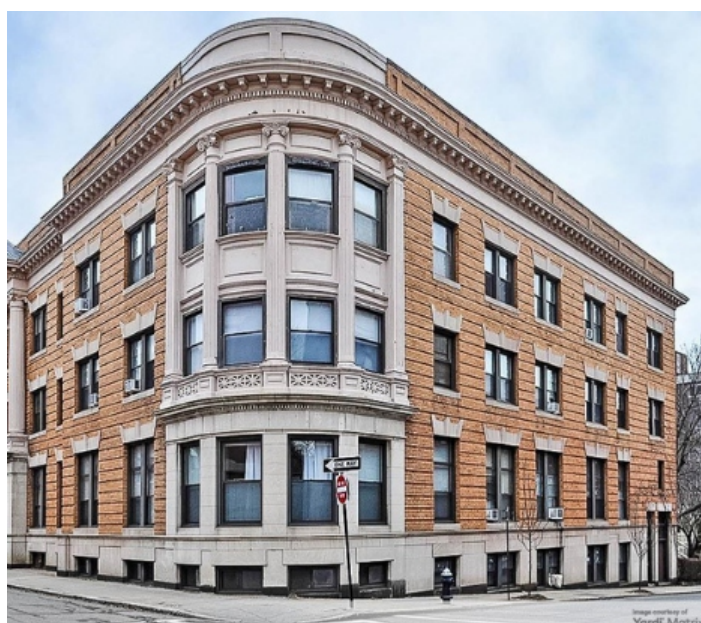
9 Sewall Avenue, Boston, MA, built 1880

Boston is the oldest city when it comes to the average age of its old buildings – 105 years old. Of course, you can't have such a rich history and be home to heritage protection organizations like The Boston Preservation Alliance without cherishing your olden buildings. While you can't rent the 1680s Paul Revere House, the oldest apartment building that does rent here is 141 years old and still stands tall on Sewall Avenue – an 18th-century road right by the historical Coolidge Corner.