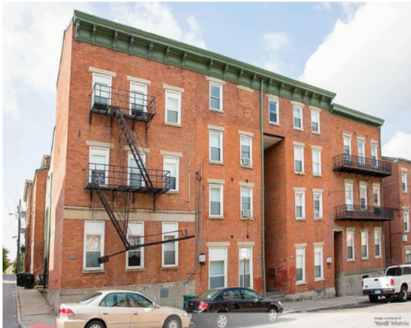
Pendleton, Cincinnati, OH, built 1850

Six of the 20 oldest apartment buildings are in prime locations such as upper-class Manhattan neighborhoods or near Yale University in the heart of New Haven, CT. As time went by, cities flourished around them and these structures became enduring staples of the community.